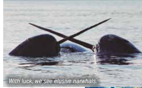
With luck, we see elusive narwhals.