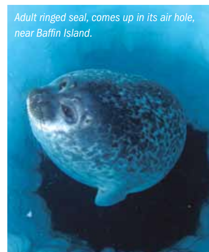
Adult ringed seal, comes up in its air hole, near Baffin Island.