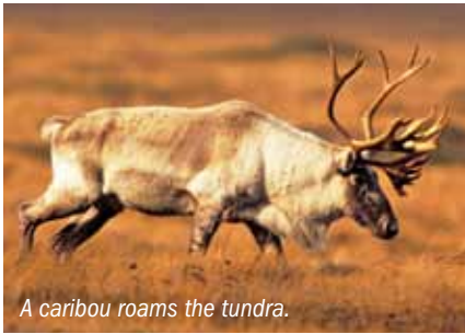
A caribou roams the tundra.

Disko Bay's waters, alive with bergs, growlers and bergy bits deliver us to the Arctic's 'mecca': Ilulissat Icefjord . At Sisimiut we'll discover vestiges of the 18th-century past. Then exploring further along Greenland's beautiful, glacier-gouged west coast, keeping a lookout for humpback and minke whales, we'll encounter the dramatic finale of our voyage: the 100-mile-long Kangerlussuaq Fjord , with its emerald waters at the fjord head and soaring mountains in the middle.